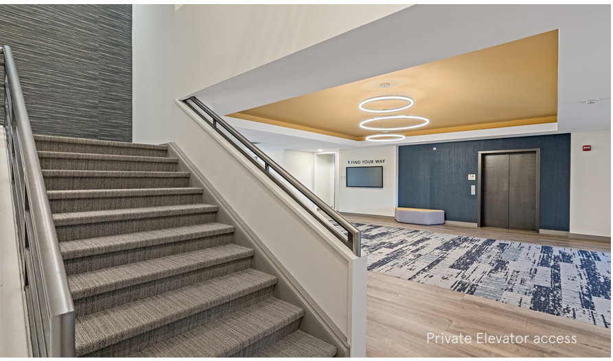
Private Elevator access