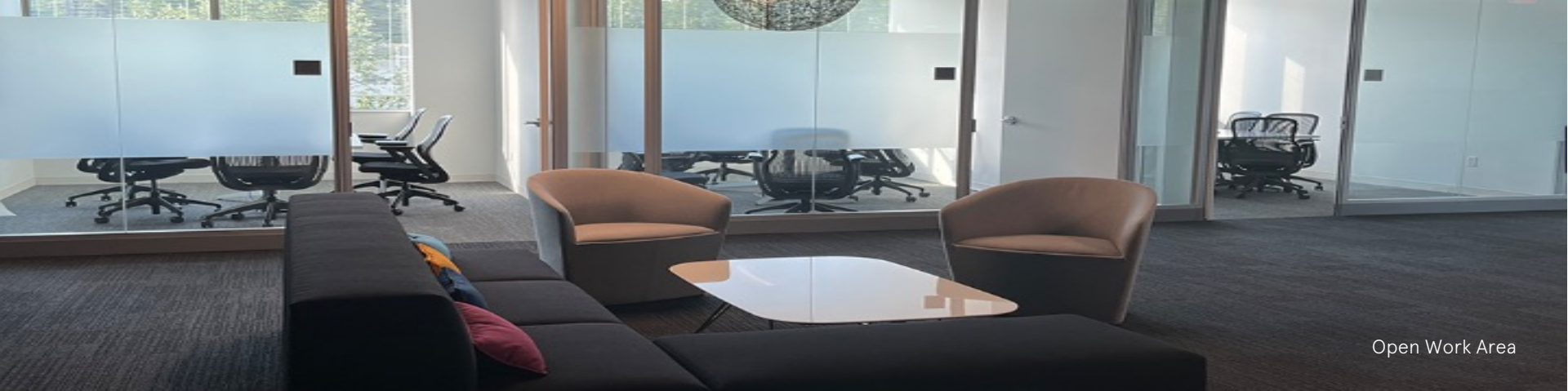
Open Work Area