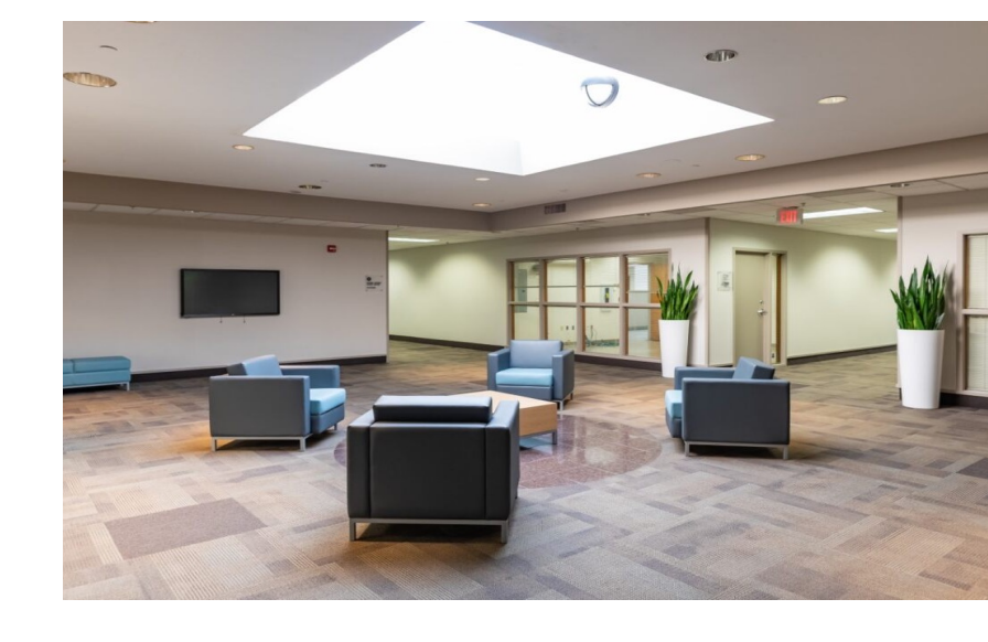
3,966 SF Available Now