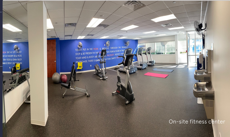
On-site fitness center