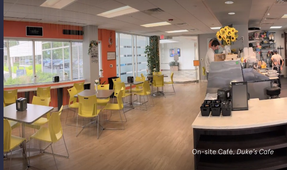
On-site Café, Duke's Cafe