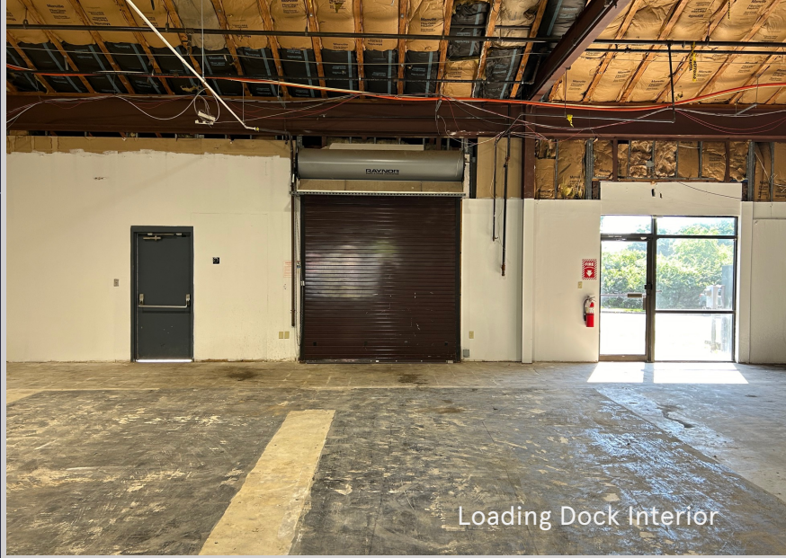
Loading Dock Interior

Features: Direct entrance, and individualized HVAC & electric