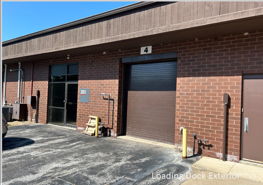
Loading Dock Exterior