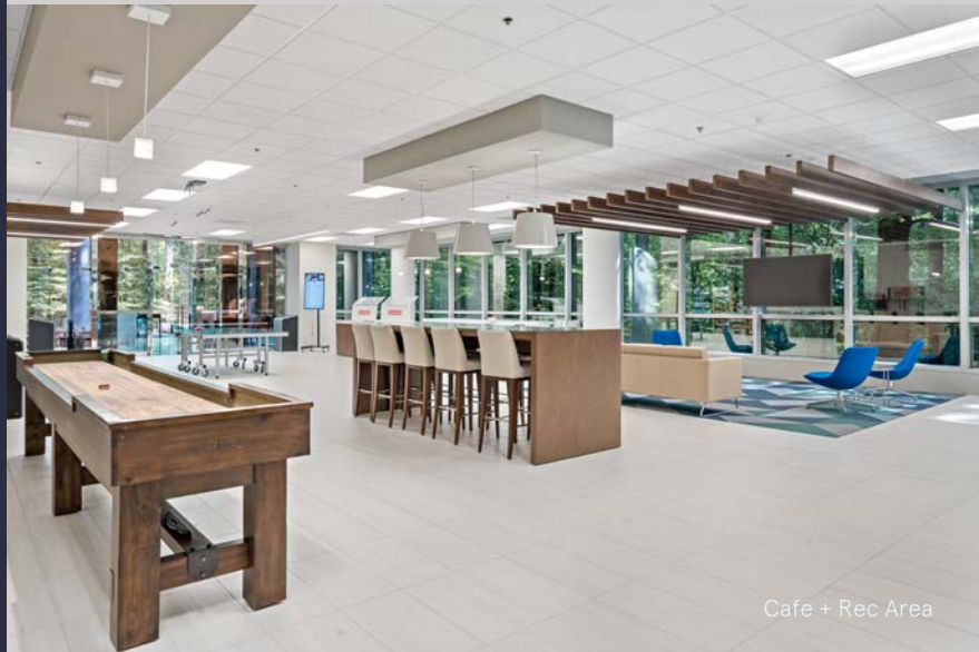
Cafe + Rec Area