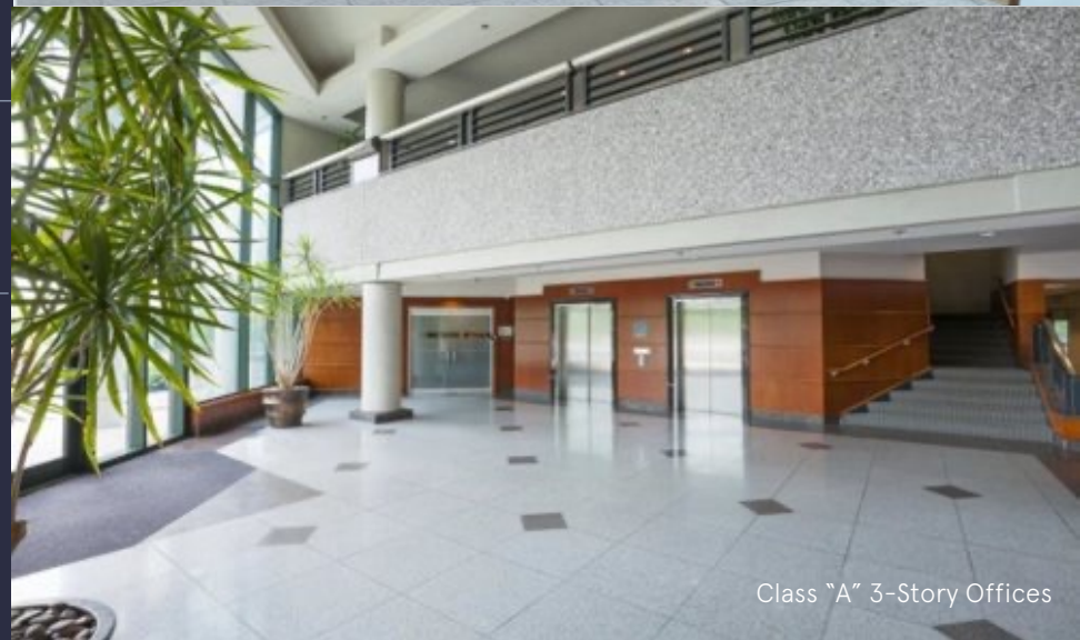
Class "A" 3-Story Offices