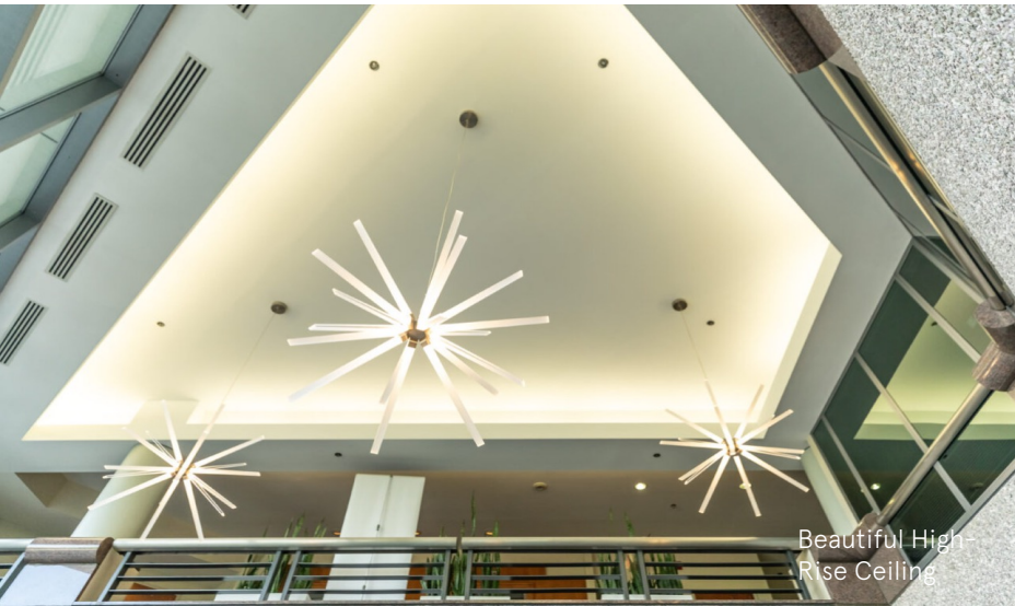
Beautiful High-Rise Ceiling