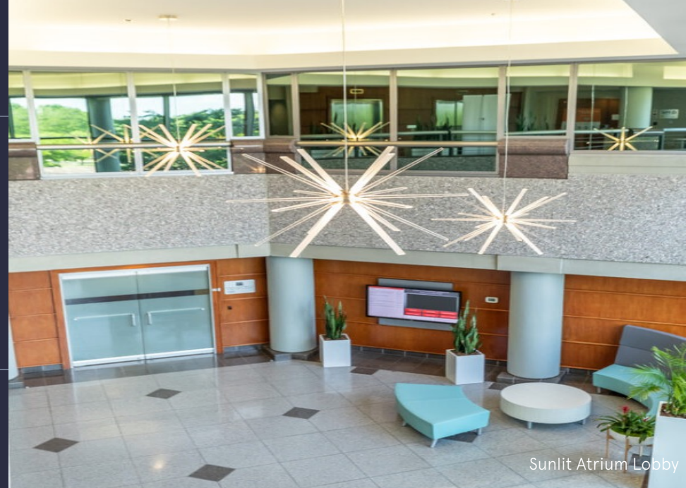
Sunlit Atrium Lobby