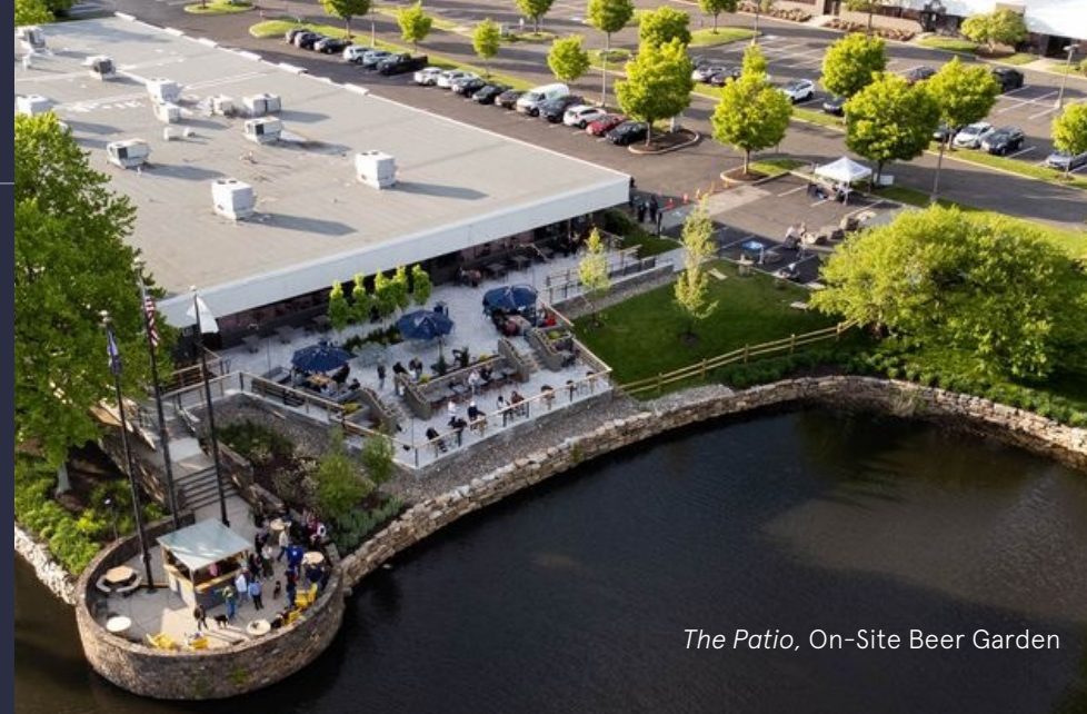
The Patio, On-Site Beer Garden