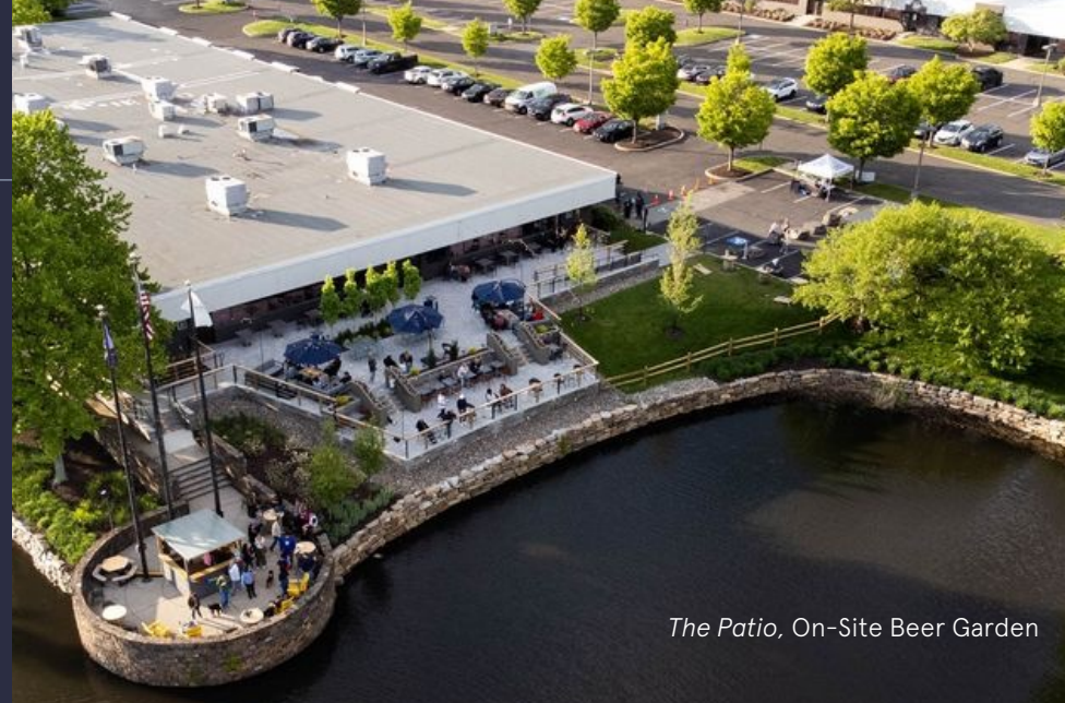
The Patio, On-Site Beer Garden