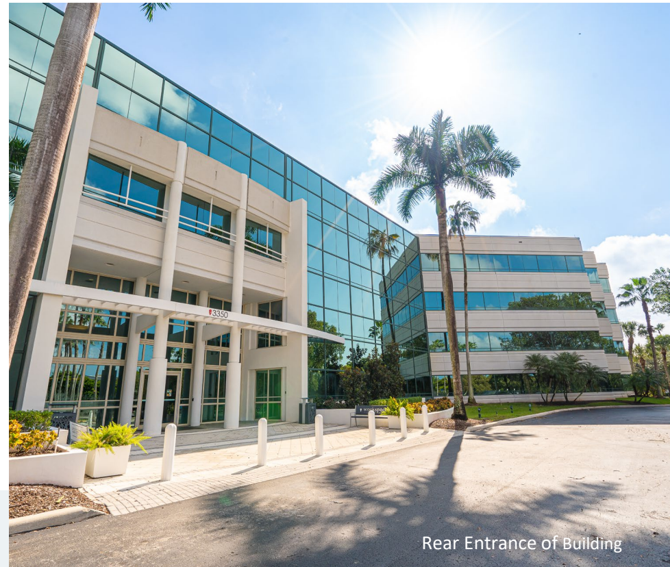
Rear Entrance of Building