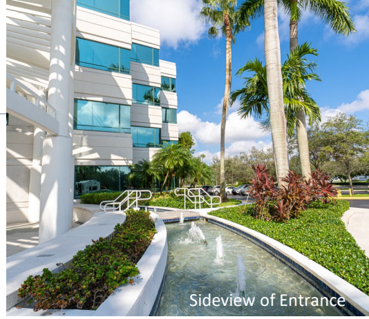
Sideview of Entrance