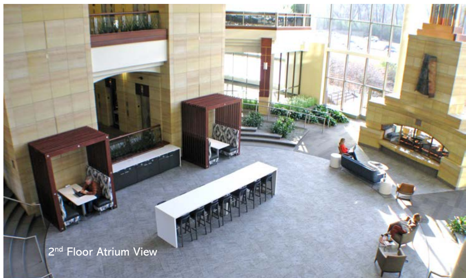
2nd Floor Atrium View