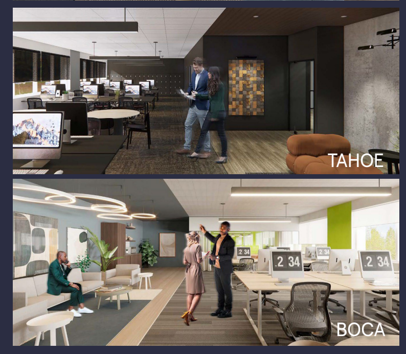
*Indicative of the look and feel (not the actual suite)