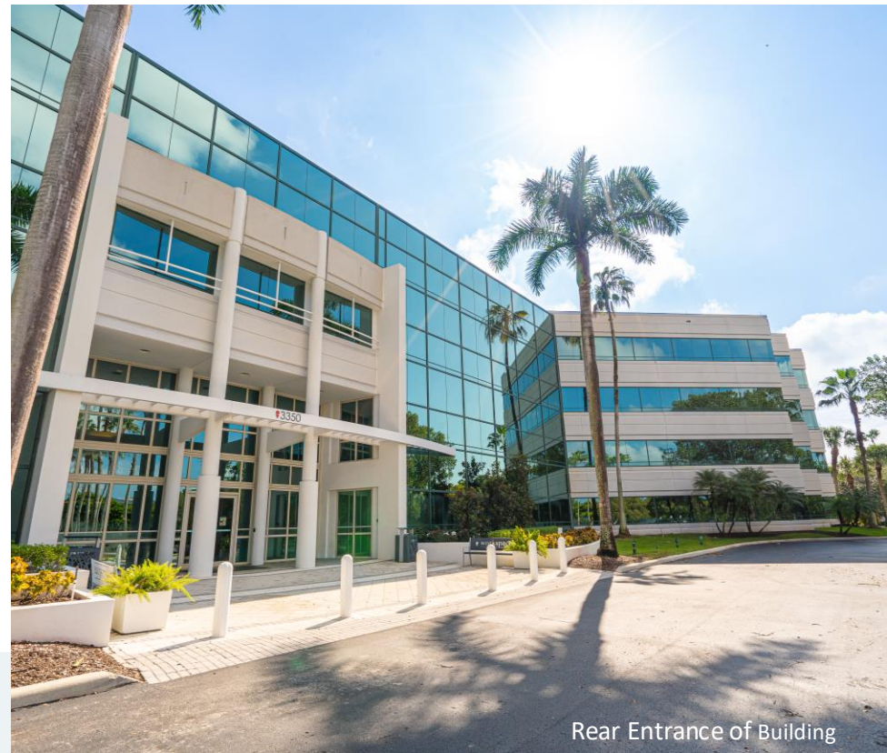
Rear Entrance of Building