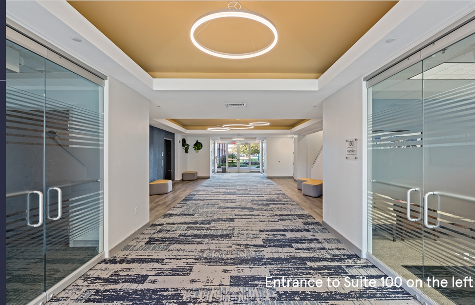
Entrance to Suite 100 on the left