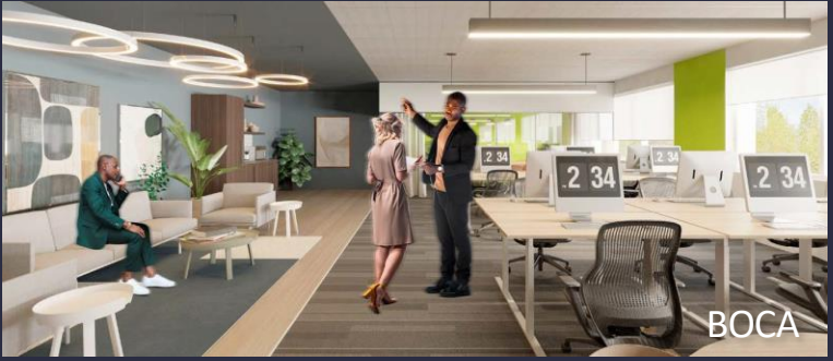
*Indicative of the look and feel (not the actual suite)