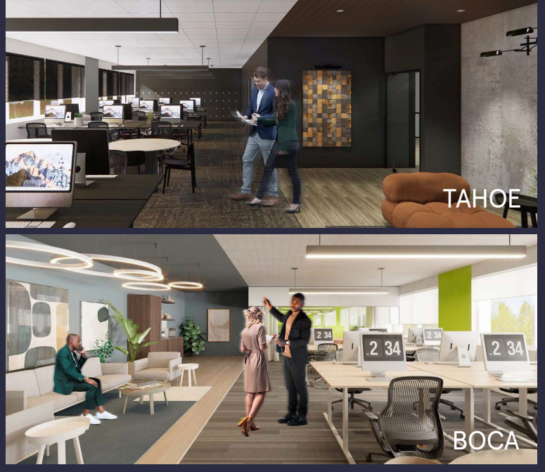
*Indicative of the look and feel (not the actual suite)