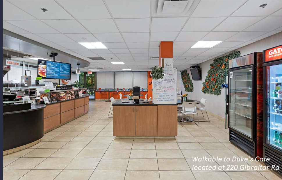
Walkable to Duke's Cafe located at 220 Gibraltar Rd