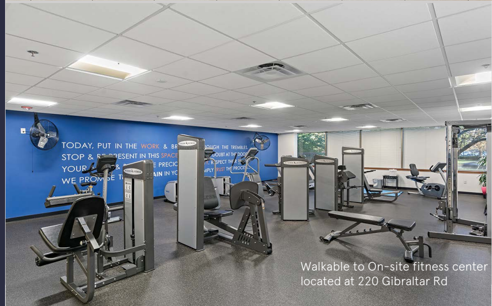
Walkable to On-site fitness center located at 220 Gibraltar Rd