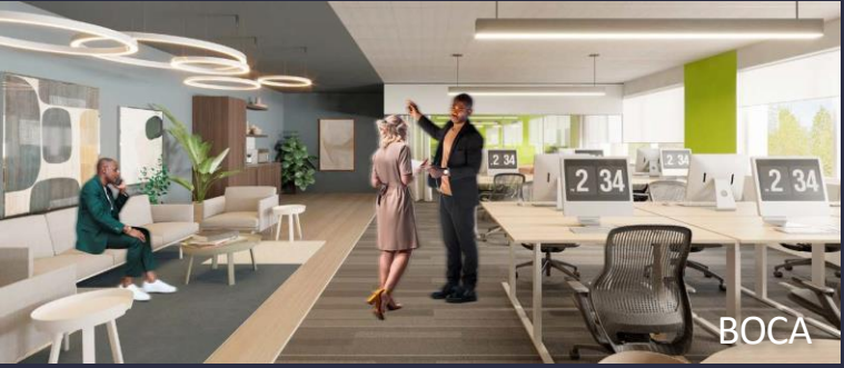
*Indicative of the look and feel (not the actual suite)